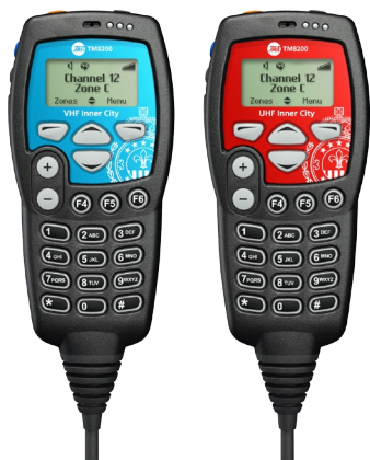
Custom lenses allow easy identification of multiple radios in the same vehicle*