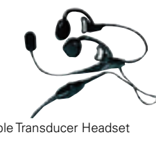
Temple Transducer Headset