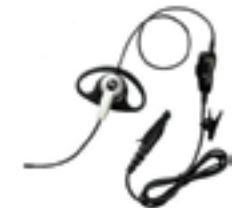
D-Style Earset with Boom- Mic