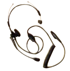
Lightweight Headset w/Boom Mic and in-line PTT