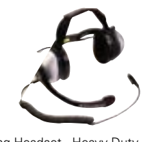
Racing Headset - Heavy Duty