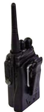
Plastic carry Holder with Belt clip