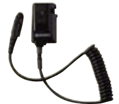
Ear Mic VOX/PPT Interface Module