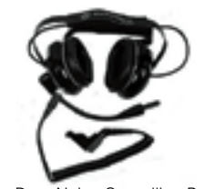
Heavy Duty Noise Cancelling Boom Mic w/ PTT Earcup