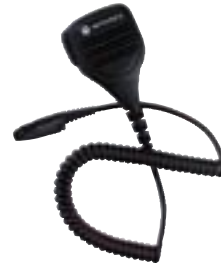
PMMN4023 Remote Speaker Microphone IP57-Rated (Mic Head only)