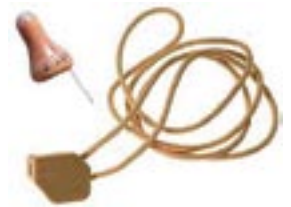
Wireless Discreet Earpiece