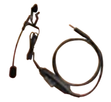
Ultra-Light headset w/Boom Mic and in-line PTT

The following audio accessories are available for use with the radio in a non-IP67 environment. The radio is only IP67 rated when used without audio accessories.