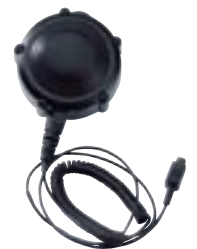
Remote Body PTT Switch for Ear Mic