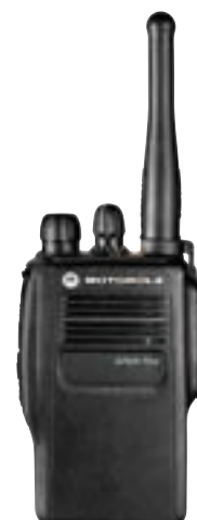
IP67 Rated and FM Approved GP629 Plus

Introducing the Motorola GP629 Plus non-keypad and the GP639 Plus keypad radios, the toughest from Motorola to date. Rated IP67 dust-tight and water submersible, the radios are also resistant to knocks and drops, thanks to their ruggedised exteriors. The GP629 Plus and the GP639 Plus feel right at home in the dangerous, extreme world of emergency rescue operations. Lightweight and compact, Motorola's smallest professional two-way radios have received Factory Mutual (FM) Approval and meet Military Standards (MIL) 810C, D, E and F.