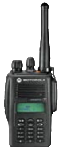
IP67 Rated and FM Approved GP639 Plus