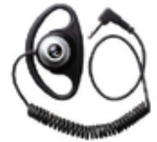
D-Shell RSM Earpiece