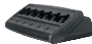
Multi-Unit Charger (order 6 battery inserts PMLN5010 separately, to charge IP67 radios in Multi-unit charger)