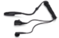
Earbud with combined Mic/PTT