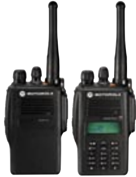
IP67 Rated and FM Approved GP628 Plus and GP638 Plus

** Availability subject to country law and regulations. Radios meet applicable regulatory requirements. All specifications shown are subject to change without notice. Specifications are not representative of all radios and may vary in different radios. All Motorola products are manufactured under ISO 9001 standards and are subjected to Accelerated Life Testing (ALT). A series of stringent tests simulating five years of usage on the field, ALT ensures that the products survive drops/shocks, dust, rain, harsh chemicals and radiation. Our Intrinsically Safe products meet formal safety agency certifications, such as Factory Mutual Research Corporation (FM) and Military Standard (MIL). * Dust-tight and water submersible are tested as per criteria in IEC (International Electrotechnical Commission) 60529 IP67