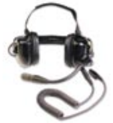
Heavy Duty Noise Cancelling Boom Mic w/PTT Earcup