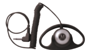
D-Shell RSM Earpiece