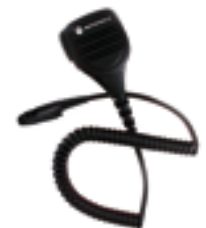
Remote Speaker Microphone