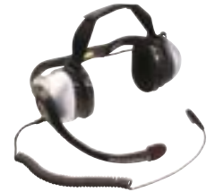
Racing Headset – Heavy Duty