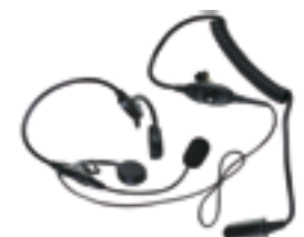
Temple Transducer Headset